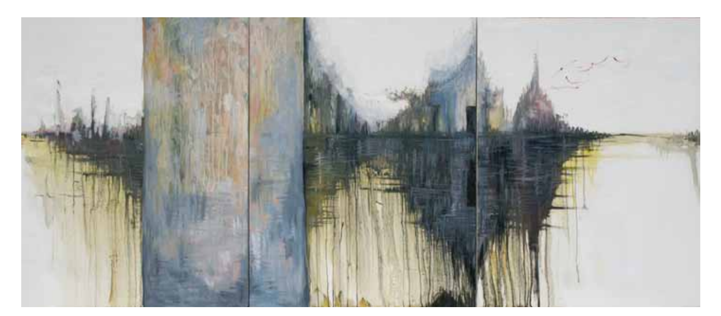
Rattana Salee 15/12/2011, 2012, Oil on canvas, 90 x 210 cm (3 panels)

into each other and the overall sense of visual and spatial unity echoes the harmony usually reserved for a single piece of work. Synonymous with her sculpture, here is homogeneity of palette. The colours of these works are consistently dense, and grey overtones reside both in her sculpture and her application of paint, reflecting the meeting of intention and its visible tangible signs.