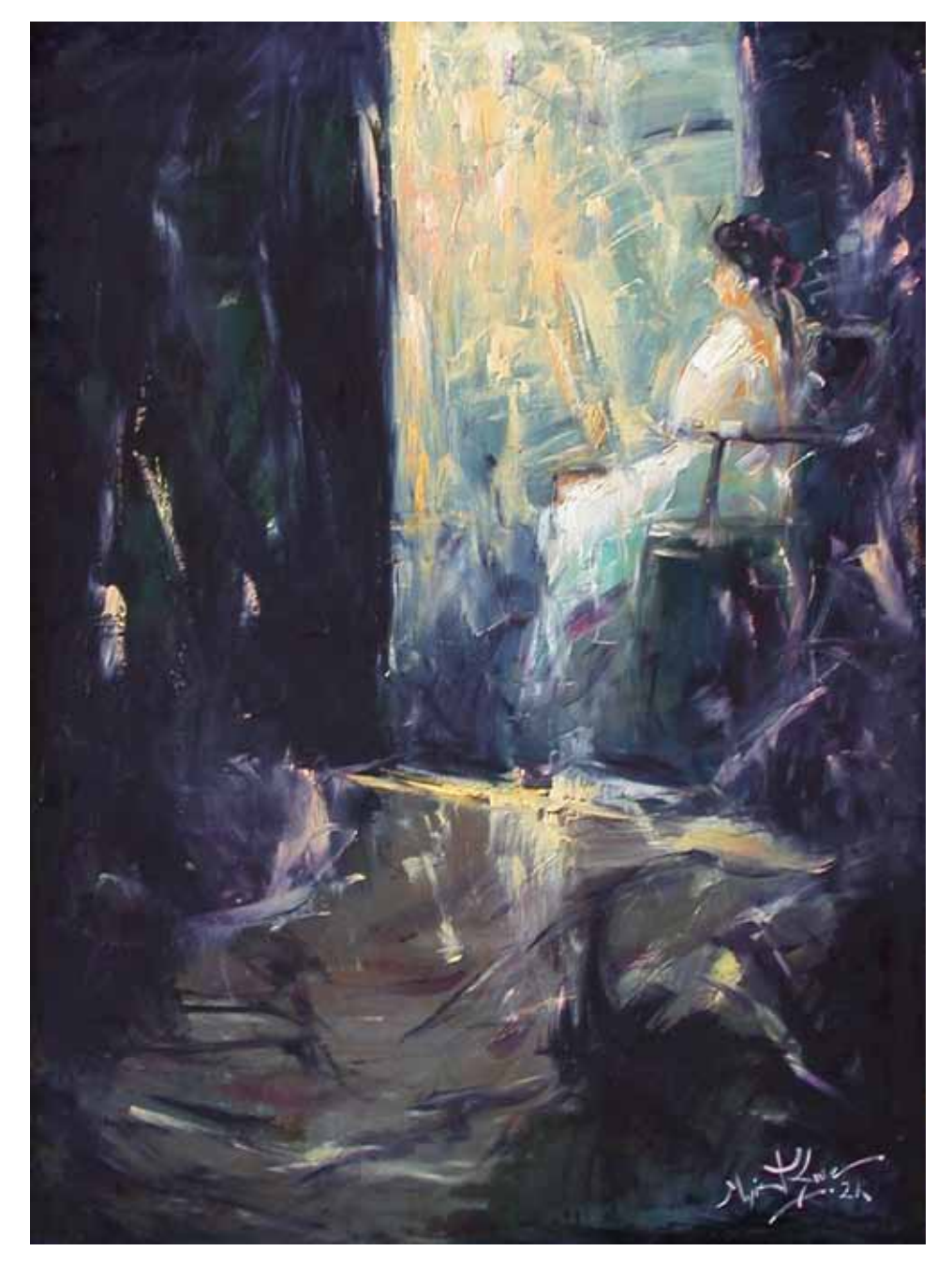
Aung San Suu Kyi by Myint Swe (a male artist)

The artistic voice in "Myths" articulates the viewpoints of a new generation of Southeast Asian women, women who are free to express opinions on the status of women in their respective societies from varied viewpoints that they deem to be relevant to their world. And through such articulations one may dispel the characterization of the Southeast Asian woman embedded in its cultural history whether in the iconic form of Apsaras, the mythical nymphs that appear in many fables, or in the romantic imagery of "delicate" Vietnamese women in flowing ao dais. Though Thailand, Vietnam and Myanmar have been bound by a common history and though they may share common social and cultural values, their political histories carved out distinctively different paths that are today most visible through varied socio-economic and political environments.