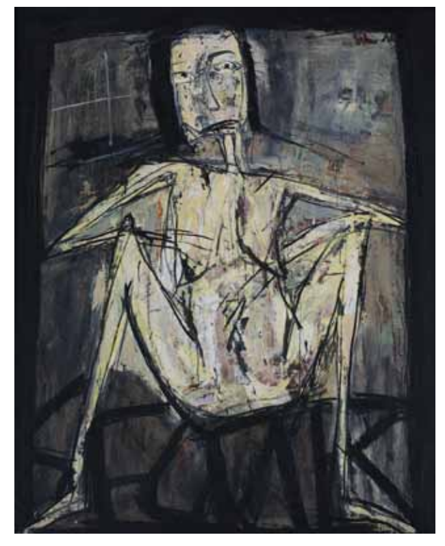
Dinh Y Nhi

Though Vietnamese modern painting emerged in the late nineteenth century and was further nurtured under French Colonial rule in the first half of the twentieth century, it was largely dominated by male artists. However the late 1980s witnessed fundamental and prolific changes in Vietnam and a new generation of artists would subsequently emerge. The older generation included women artists, such as