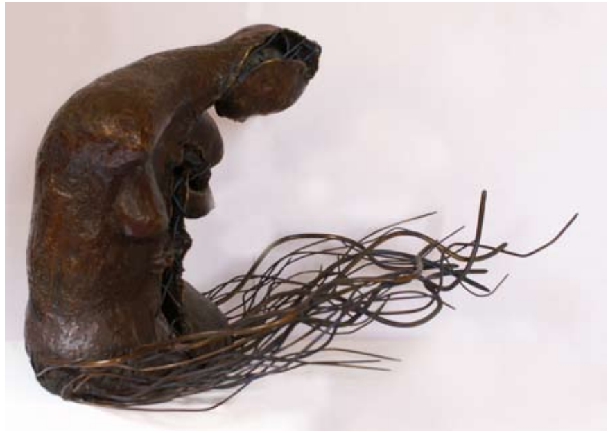
On The Verge, 2010 Brass 43 x 50 x 87 cm