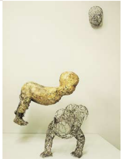
Contemplation of Death no. 2, 2010 Galvanized wire, brass and fiberglass 100 x 100 x 135 cm