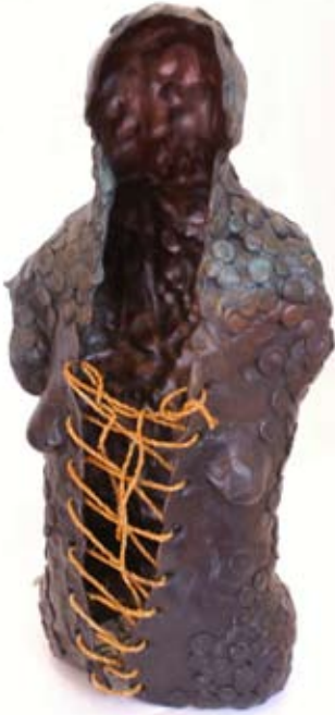
Body, 2009 Bronze 18 x 32 x 57 cm